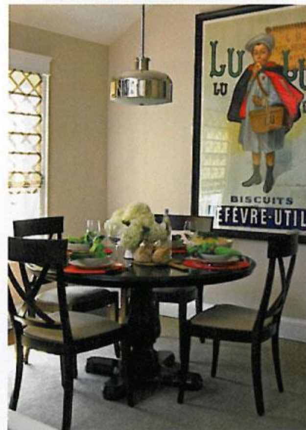
ABOVE: Like the desk, the adjacent dining area blends in beautifully with the kitchen. It carries on the kitchen's mixture of warm wood and simple colors with dashes of modern elegance such as the pendant fixture over the table.

Whether the Barkers are feeding breakfast to Gracie, hosting backyard barbecues or entertaining connoisseurs from their gourmet cooking and wine clubs, their new kitchen is at the center of all the action. "We always serve hors d'oeuvres and wine in the kitchen," Katie says. "I can watch the trees in the backyard change with the seasons. And Gracie can play there and in the lower family area, which opens off the kitchen." ♦