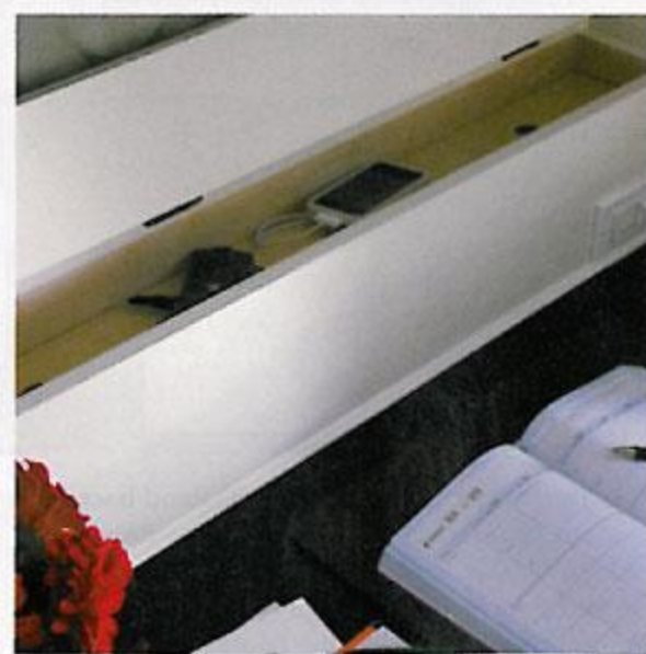
RIGHT: Tucked into the desk area is a charging station for cell phones and digital music players—a great touch for this high-traffic space.

The 375-square-foot kitchen's focal point is the dark walnut island, which echoes the Brazilian walnut floor. Surrounding the island is a powerful perimeter of cooking, storage and food-prep areas. "The marble countertop—Calacatta gold—has a border that is a double thickness that gives it prominence," Donner says. "And the sink in it that faces the range makes it particularly convenient for cooking and filling pots."