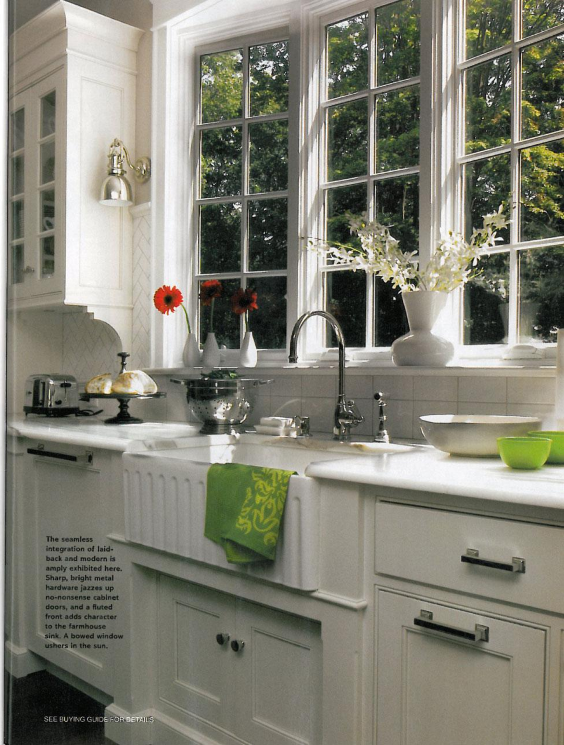
The seamless integration of laid-back and modern is amply exhibited here. Sharp, bright metal hardware jazzes up no-nonsense cabinet doors, and a fluted front adds character to the farmhouse sink. A bowed window ushers in the sun.