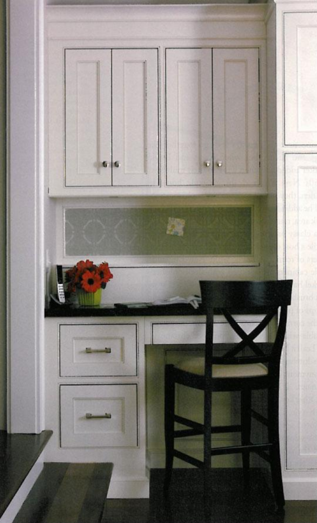
ABOVE: An understated desk area was crafted from the same cabinets used to outfit the kitchen proper.